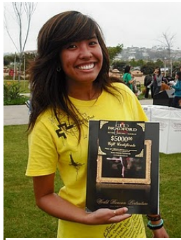
A Good Shepherd Youth Won a $5,000 Prize at the Photochar-

The first walk was for Photocharity to help open a new young adult