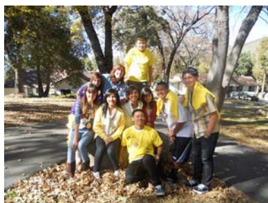
Pre-Con Group at Retreat