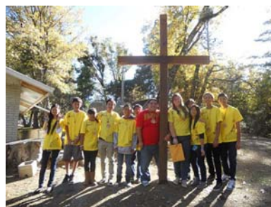
Pre-Con Group at Retreat