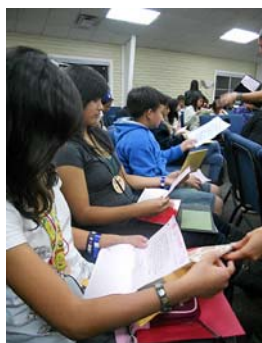
Youth Receiving Letters from Families

On November 12, 2010, the youth in Pre-Confirmation went on a retreat at the Palomar Christian Conference Center. Retreat is where they get to leave everything behind and