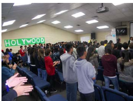
Sing-Along Ice Breakers

was full of singing, listening to talks, and most importantly worshipping God. While on retreat, many junior facilitators gave talks about their relationship with God, family, friendship, etc. After each talk, they had time to reflect on it. Many of them were able to relate to all of the talks. The youth were also able to go to reconciliation while on retreat. The students were able to confess their sins and start anew with a clean soul.