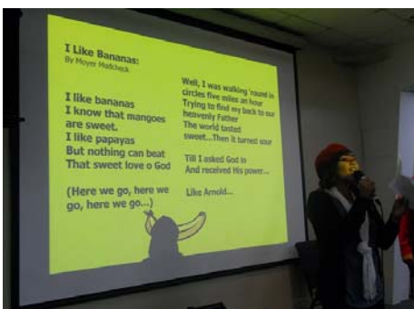
Teaching "I Like Bananas" Song