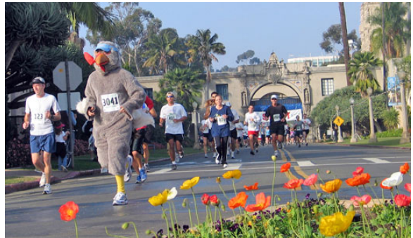
Father Joe's Thanksgiving Day Run/Walk 2010

ing morning! What better way to kick off Thanksgiving then to get up and burn some