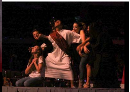
Skit at LA Youth Day 2009