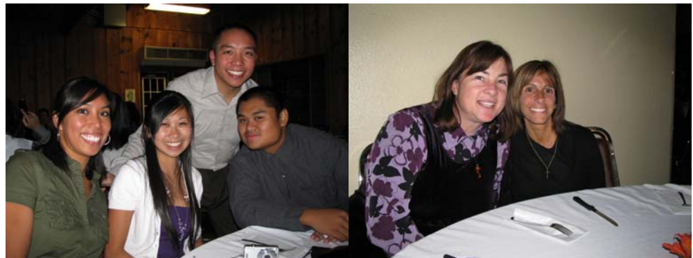
Adult facilitators at the Pre-Confirmation Retreat dinner

8200 Gold Coast Drive San Diego, CA 92126 Phone: (858) 271-4128 Email: pclasby@san.rr.com