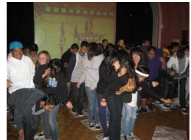
Games at the All Night Party