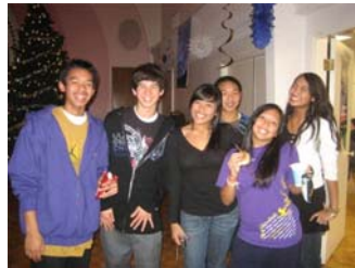
Hanging out at the All Night Party