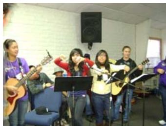
Music group teaching songs