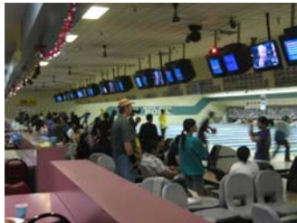
All Night Party—Bowling Alley

Harvestfest 2008 was, as it is every year, a success for our parish community. Not only did we get an outpouring of help from the community, but also huge support from our parish in the number of people who came. Thank you to everyone who came out to support us, and to everyone who took an active role in helping out for those three days. Hope to see you again next year!