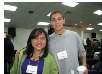
Hanging out at retreat