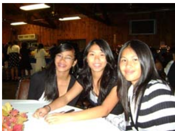
Pre-Con students at retreat