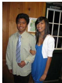
Being escorted to dinner