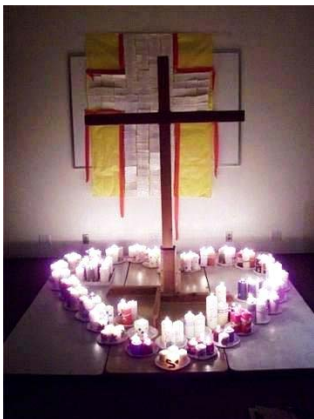
Lighted candles around cross