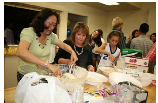
Parishioners helping out with the Louisiana Thank You dinner