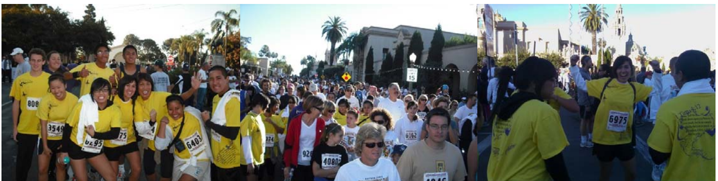
Thanksgiving Fun Run 09