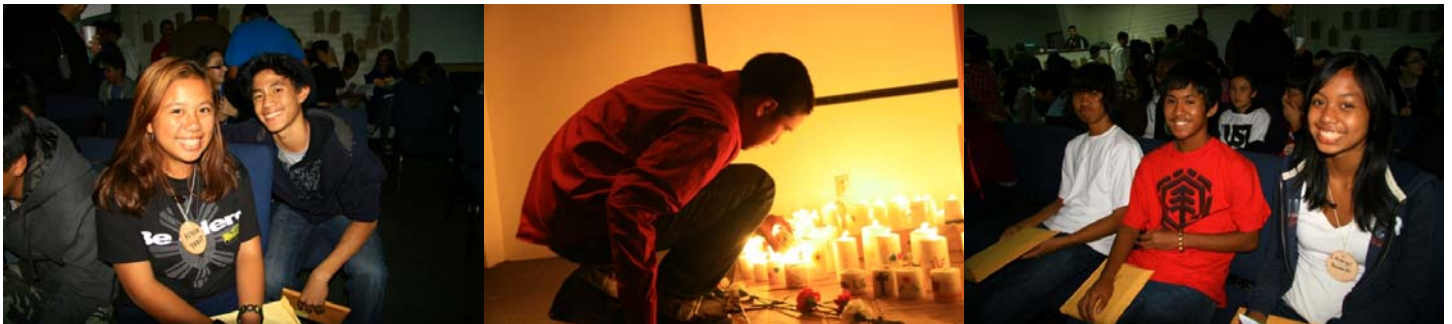
Pre-Confirmation Retreat 09-10