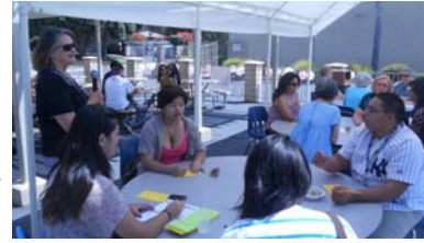
A fun game of Bunko