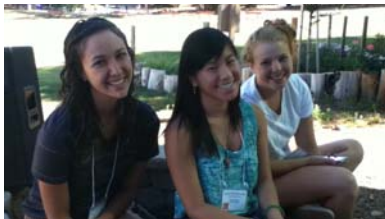
Youth at mass