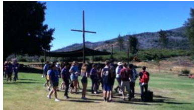
Youth at morning prayer