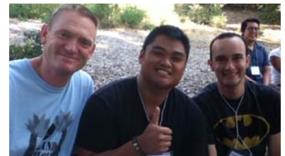
Young adults and adults at camp