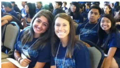
Last day of camp