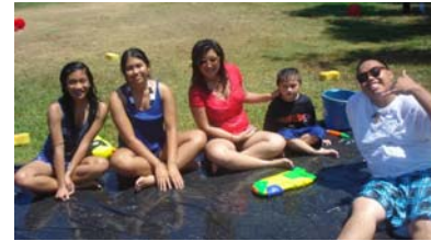
Youth hanging out at Water Olympics