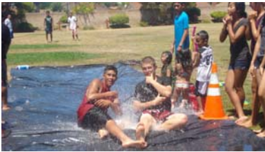
Youth on slip and slide

At the end of all the wet fun, everyone helped pack up and cleaned the field. It was a fun-filled day that was well-deserved during this hot summer.