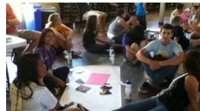
Small group time