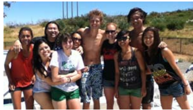
Youth bonding at the pool