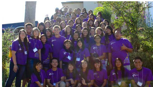
Core Team 2011-2012