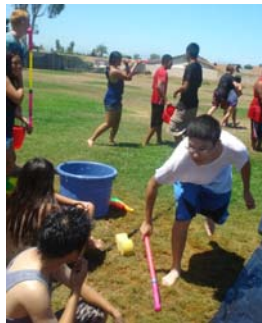
Youth playing sponge game