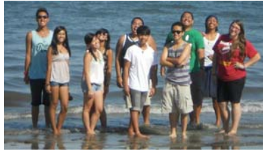
Youth at end of summer bonfire