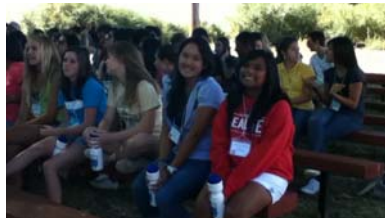
Youth at mass