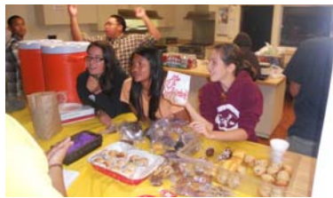
Youth selling concessions at Movie Night