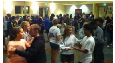
Learning to swing dance