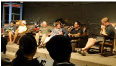
Married, single, and religious life Q&A session

As a rookie, this had been the best Camp Emmaus I've ever been too. I absolutely loved the experience and I wish I could enjoy it over and over again. I'll never forget the memories that were made or the people I met and befriended. I wouldn't trade anything for the world that one week. It was the best ever.