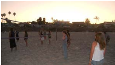
A fun game of volleyball